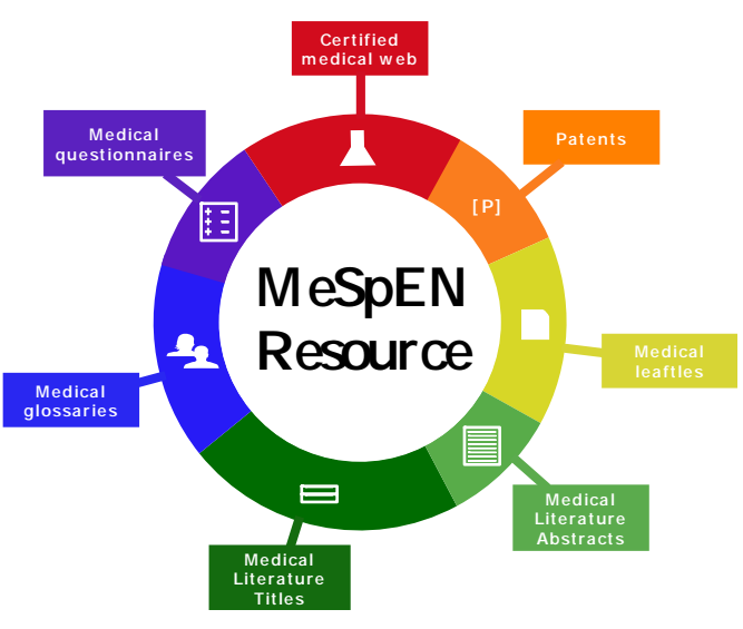
Figure 1: MedSpEN content overview.

Technologies), launched by Spanish Ministry of State for Telecommunications with the aim of providing specialized technical support to research and development of software solutions adapted to the field of biomedicine (Villegas et al., 2017). These resources are publicly available for download at <u>http://temu.bsc.es/mespen</u>.